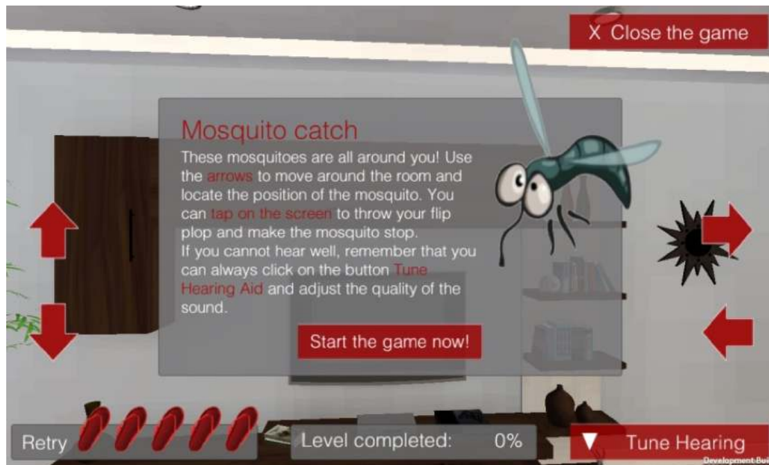
Figure 2. Early visualization of a videogame built using 3D Tune-In technologies