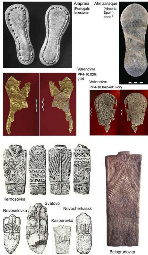
Figure 4. SANDALS/shoe representations from the Iberian Chalcolithic (top) and on Yamnaya stelae from the Ukraine (bottom) (after Murillo Barroso et al. 2015 [with further Iberian references on 'sandals'] & Telegin & Mallory 1994).