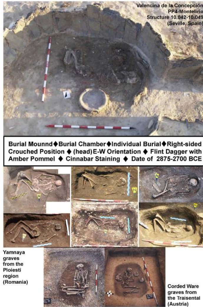
Figure 3. The burial of Valencina de la Concepción, PP4-Montelirio, structure 10.049 compared to Yamnaya/CWC graves in Romania and Austria (after García Sanjuán et al. [ed.] 2013, Frînculeasa et al. 2015 and Neugebauer 1987).