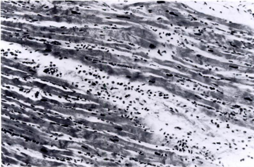
FIGURE 1. Photomicrograph of the myocardium of an elephant with diffuse acute myocarditis. There is edema of the interstitium and a mixed infiltration of polymorphonuclear leucocytes, lymphocytes and histiocytes. H&E, \times 200 .

al., 1977, J. Am. Vet. Med. Assoc. 171: 902–904). That incident also involved African elephants, but the lesions described were more of a nonsuppurative myocar-