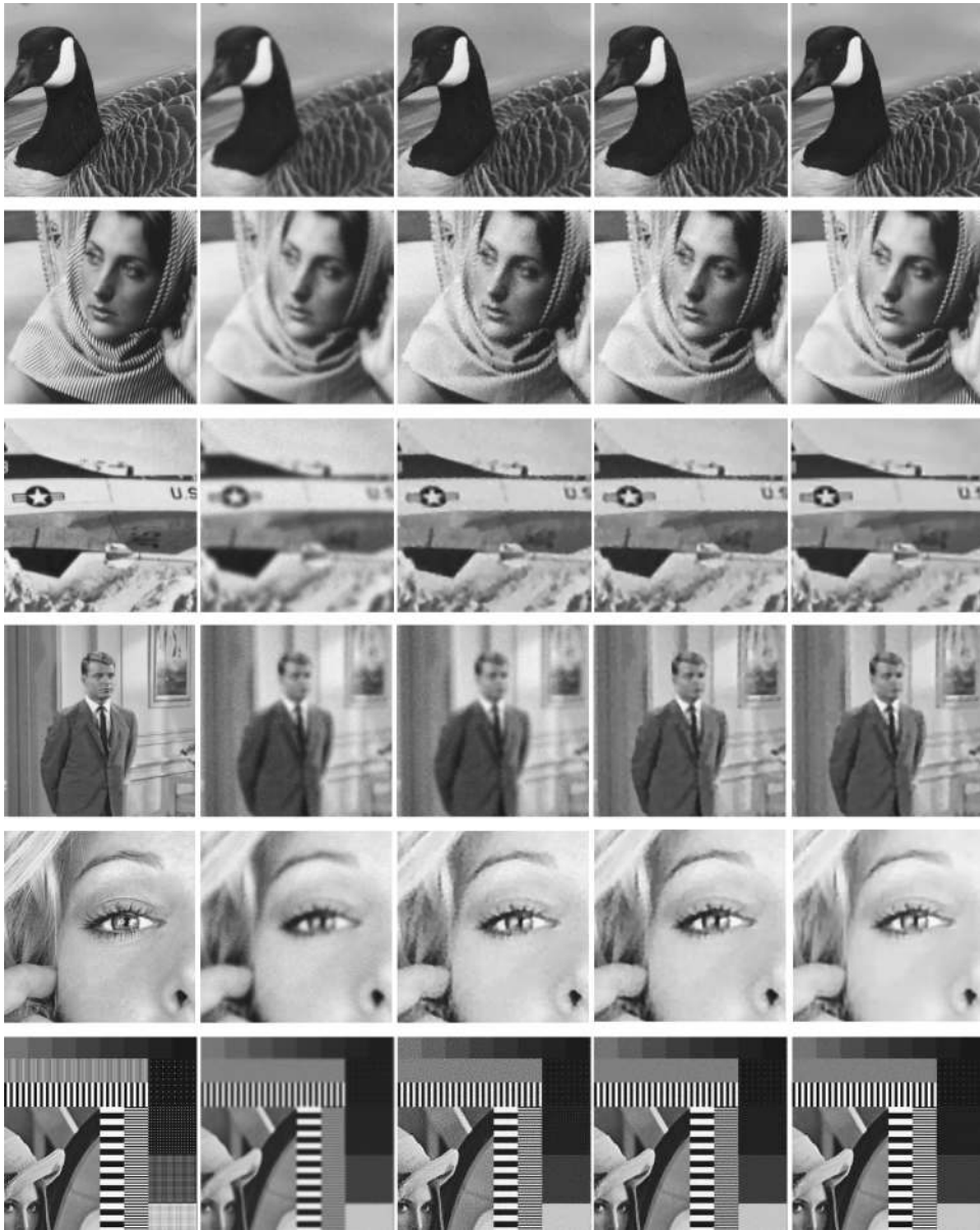
FIGURE 4. Zoom-in to the texture part of “Duck”, “Barbara”, “Aircraft”, “Couple”, “Portrait II” and “Lena”. Images from left to right are: original image, observed image, results of the balanced approach, results of the analysis based approach and results of the PD method.