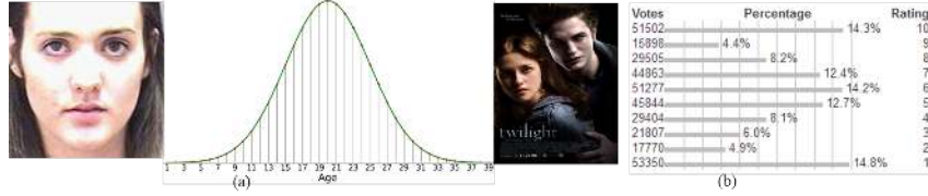
Figure 1: The real-world data which are suitable to be modeled by label distribution learning. (a) Estimated facial ages (a unimodal distribution). (b) Rating distribution of crowd opinion on a movie (a multimodal distribution).