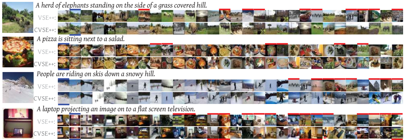
Figure 2: Comparison of the sentence-to-image top-30 retrieval results between VSE++ (baseline, 1st row) and CVSE++ (Ours, 2nd row). For each query sentence, the ground-truth image is shown on the left, the totally-relevant and totally-irrelevant retrieval results are marked by blue and red overlines/underlines, respectively. Despite that both methods retrieve the totally-relevant images at identical ranking positions, the baseline VSE++ method includes more totally-irrelevant images in the top-30 results; while our proposed CVSE++ method mitigates such problem.

where \alpha_1, \dots, \alpha_L are the margins between different non-overlapping sentence subsets.