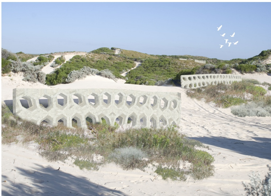
Figure 4 Inspired by the processes that facilitate the growth of coral, this 'fence' serves as permeable boundary marker as well as 'dune catcher', helping to retain blowing sands in the re-growth of dunes.

In both design and ecology, scale matters (Menz et al. 2013). In this regard, baroque strategies function across scales; as a technique, the baroque is flexible and can be applied to the large park, the linear verge or the garden. Within the OCBIL landscape, where every patch is significant, the addition of patches increases the footprint of ecologically relevant landscapes. Embracing a neo-baroque ecology, one can facilitate this increase, in essence crowdsourcing patches by adding aesthetic function to their value. Additionally by creating gardens of pleasure that are also manifest with ecological depth, horticultural practice can begin to serve the need of systems, addressing some of the constraints, including financial and social, identified by many ecologists (Miller and Hobbs 2007). In recreating the bush, there is an underlying sense that the space does not need to be maintained. If a landscape is treated as a garden, maintenance and care become intrinsic components (Janzen 1998; Goddard et al. 2010b). In reconnecting landscape systems with a regenerative design of the Third Nature, a neo-baroque ecology resonates the historic rapport between scientist and garden architect in the temporal Baroque period. In making these propositions, there is a reconnection of the garden of pleasure with