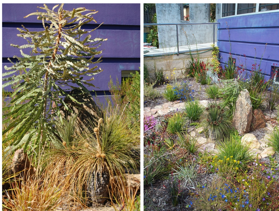
Figure 5 An example of the exuberance in detail, heterogeneity and form of the OCBIL flora.

environmental good, achieving a ‘scientific sublimation’ (Conan 2005) and, by exploiting the mutability of taste, a neo-baroque ecology allows for ecological restoration in an expanded field.