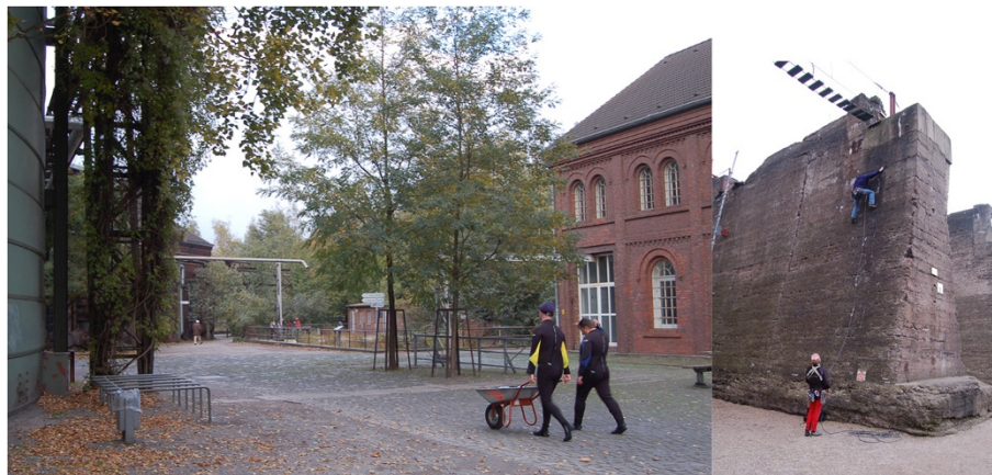
Figure 2 Landschaft Park Duisburg-Nord and some of the activities that echo those found in National Parks. The refurbished gasometer serves as a place for scuba diving and remnant walls places for climbing.