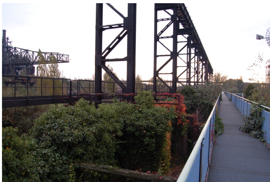
Figure 3 Landschaft Park Duisburg-Nord showing Kowarik's Fourth Nature plants returning by happenstance rather than imposition.

pleasure, this designed landscape engages what Jordan termed the 'theatre' of restoration (Jordan 1987). While the definition of novel ecosystem is extended beyond its primary ecological sense (i.e., in relation to the crossing of abiotic and biotic thresholds Hobbs et al. 2013), it exemplifies how humans can be brought closer to 'natural' ecological landscapes by engaging novel human activities rather than simply attempting to reinstate nature. Further examples of this type of engagement include: