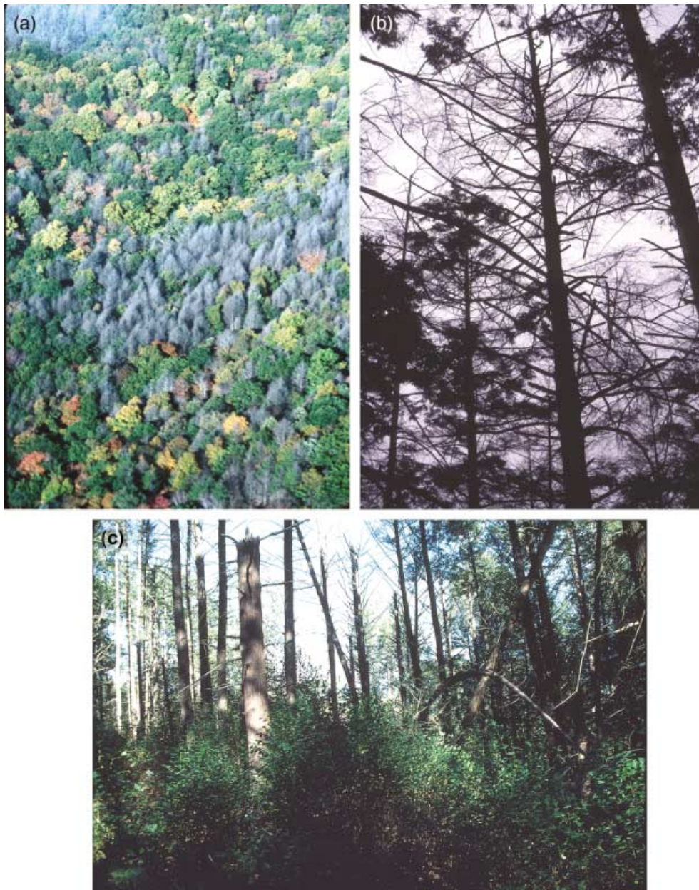
Figure 3 Composite figure of site photos. (a) Aerial view of widespread hemlock mortality resulting from hemlock woolly adelgid infestation in southern Connecticut. (b) Thinning hemlock crowns associated with HWA infestation and classified as poor vigour. This condition was observed throughout the transect but was prevalent in the southern stands. Note the loss of foliage from the interior portions of crown branches and the tufts of needles remaining on the branch tips. (c) Stand of dead and dying hemlock trees following several years of heavy HWA infestation in southern Connecticut. Prolific establishment of black birch ( Betula lenta L.) seedlings is replacing hemlock trees.

the relatively low value of hemlock timber resulting from ring shake, hemlock has not historically been a commercially desirable species (Baumgras et al. , 2000; Howard et al. , 2000). However, HWA infestations have led to unprecedented rates of presalvage removals across New England (Foster, 2000; Kizlinski et al. , 2002). In our transect the intensity of logging is greatest in the south, suggesting that land managers and owners are responding