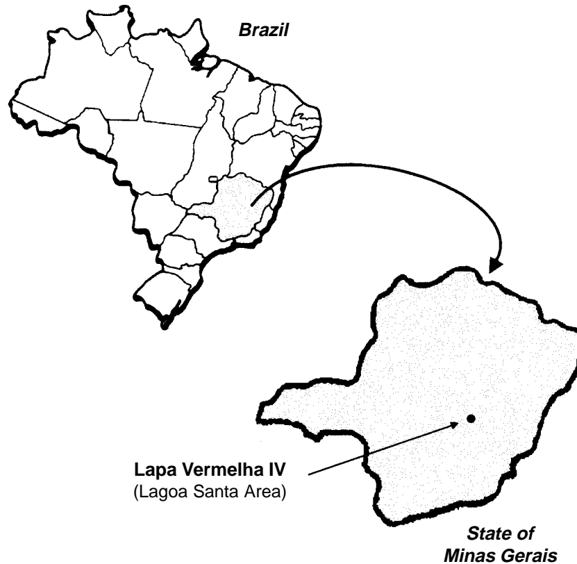
Figure 1 - Geographic location of Lapa Vermelha IV.

Vermelha IV is presented here as the oldest human remains found in the Americas, dating between 11,000 and 11,500 years B.P.*