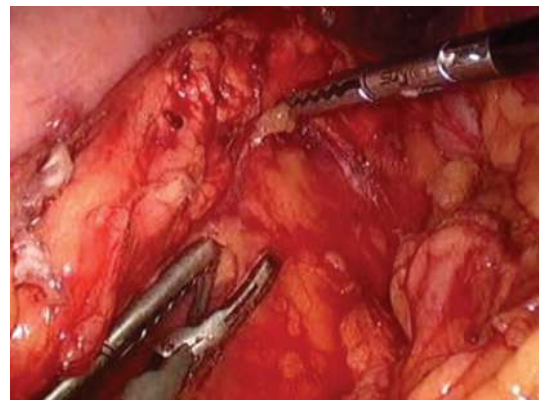
FIGURE 3: Dissection of the pancreas off the splenic vessels for spleen preservation.

splenic artery and vein are identified and individually divided with 2.5 mm linear stapling devices. The pancreas is then transected. The remainder of the procedure mirrors that of the LDP protocol.