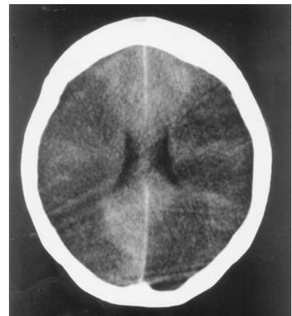
Fig. 3 Case 3. Computed tomography showed extensive cerebral infarction involving both middle cerebral and left posterior cerebral arteries