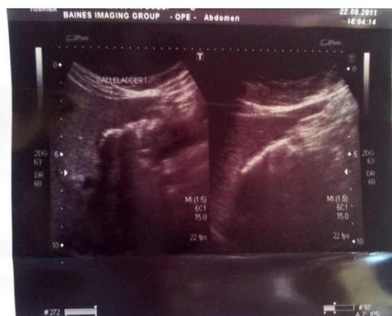
Figure 1. Ultrasound scan reported to be showing gallstones in the gall bladder

A diagnosis of symptomatic gallstones was made, and the patient was taken for a laparoscopic cholecystectomy. Upon introducing the camera port, the abdomen was noted to be filled with distended loops of large bowel and pneumoperitoneum could not be achieved. An intraoperative decision to convert to a laparotomy was made. The gall bladder was normal with no calculi. There was an omental adhesive band crossing mid transverse colon attaching to the anterior abdominal wall and causing transverse colon obstruction (photo 2). The hepatic flexure was found to be filled with stool, and the colon distal to the obstructive band was small in comparison to the proximal colon. Further exploration revealed normal intra-abdominal organs. The obstructive adhesive band was divided, a biopsy taken, and the abdomen closed in layers. Histology confirmed it was adhesions. The patient had an uneventful post-operative recovery and was discharged home on day 5. An upper esophago-gastro-duodenoscopy done 2 months later revealed mild gastritis with random biopsies which showed Helicobacter gastritis and duodenitis. The patient was successfully treated with triple therapy ( Omeprazole, amoxicillin, metronidazole).