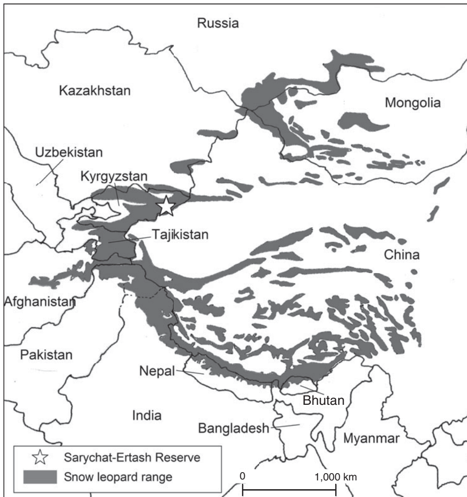
FIG. 1 Snow leopard Panthera uncia range, adapted from Fox (1994), and the location of the study area, Sarychat-Ertash Reserve, in Kyrgyzstan.