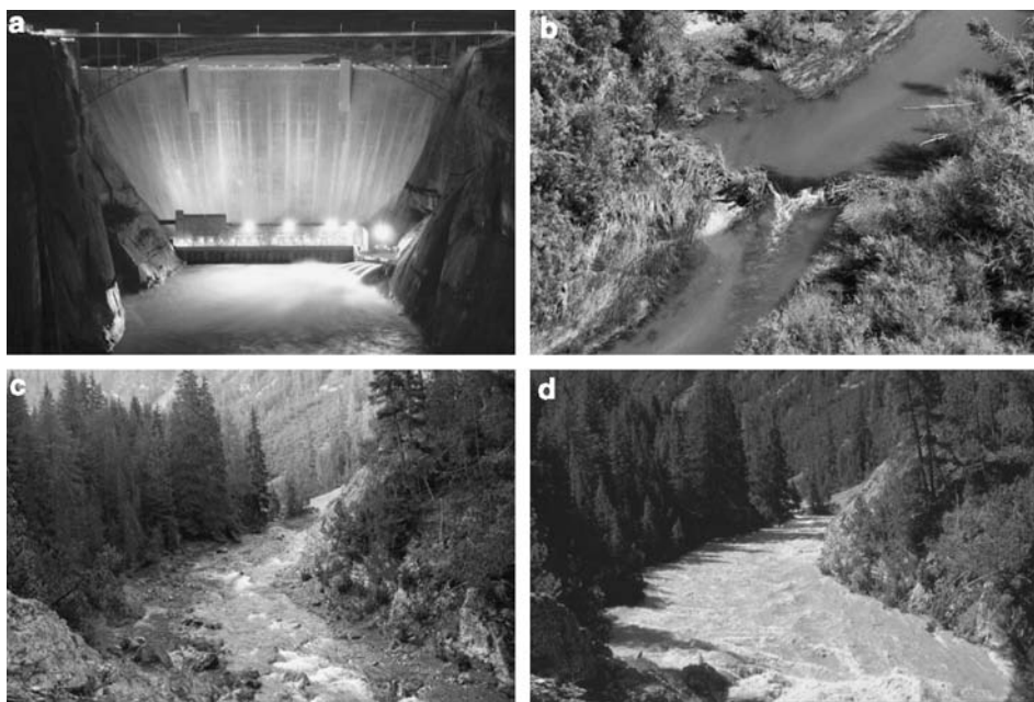
Figure 1. (a) High-flow experiment at Glen Canyon Dam, Colorado River, in 2008. (b) Flood pulse in the Bill Williams River, in Arizona, showing a major breach (more than 3 meters wide) in a beaver dam after an experimental release from Alamo Dam in 2007. The River Spöl below the dam at Punt dal Gall (Swiss National Park) (c) prior to and (d) during an experimental flood release in 2000.