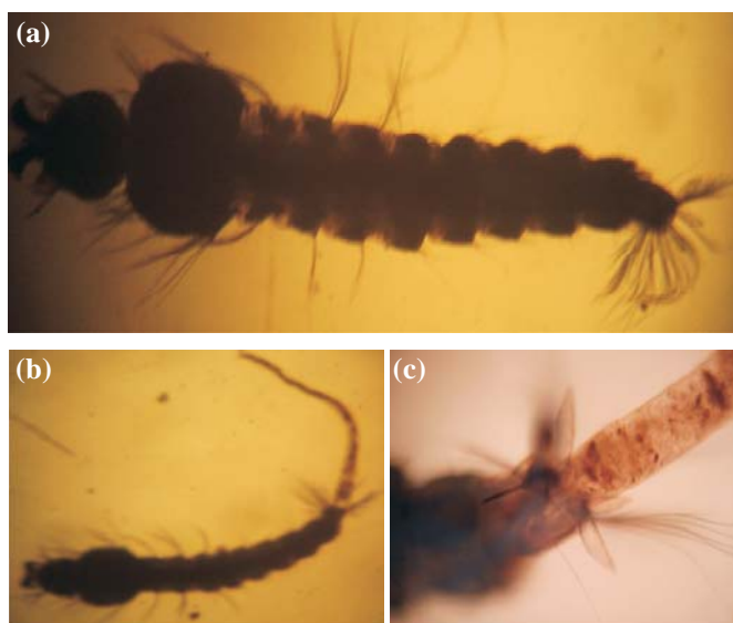
Fig. 2: Larvae deformities due to VLC fractions (3) and (4) of T. martiniana var pauloi root bark methanol extract— (a) normal larvae; (b) tailed larvae; and (c) closer look of larvae abdomen with tail connected

is metabolised by insects in order to regulate their developmental processes (metamorphosis). Therefore, the compound when produced by plants may have similar roles, suggesting that the plants would be producing the compound in order to deter insect accumulation, as the insects would not prefer to acquire additional JH III doses beyond what is normally required for metabolism. Accumulation of this compound beyond biochemically allowable levels would disrupt the insects' development process. Hence, the compound would act as a bio-insecticide. Therefore, the presence of this compound in plant extracts would make the extracts act as readily biodegradable environmental larvicides.