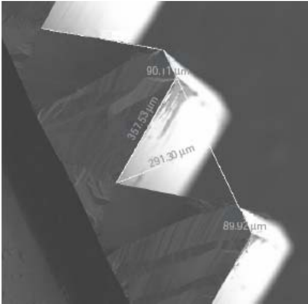
Figure 2: View of a 500 \mu\text{m} grating etched on (100) Si.