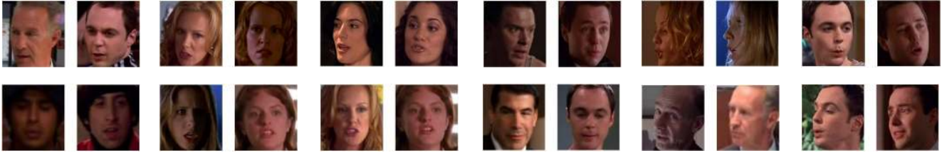
Figure 4. Typical false positive face pairs, selected from test face tube pairs, with the proposed latent metric learning algorithm.