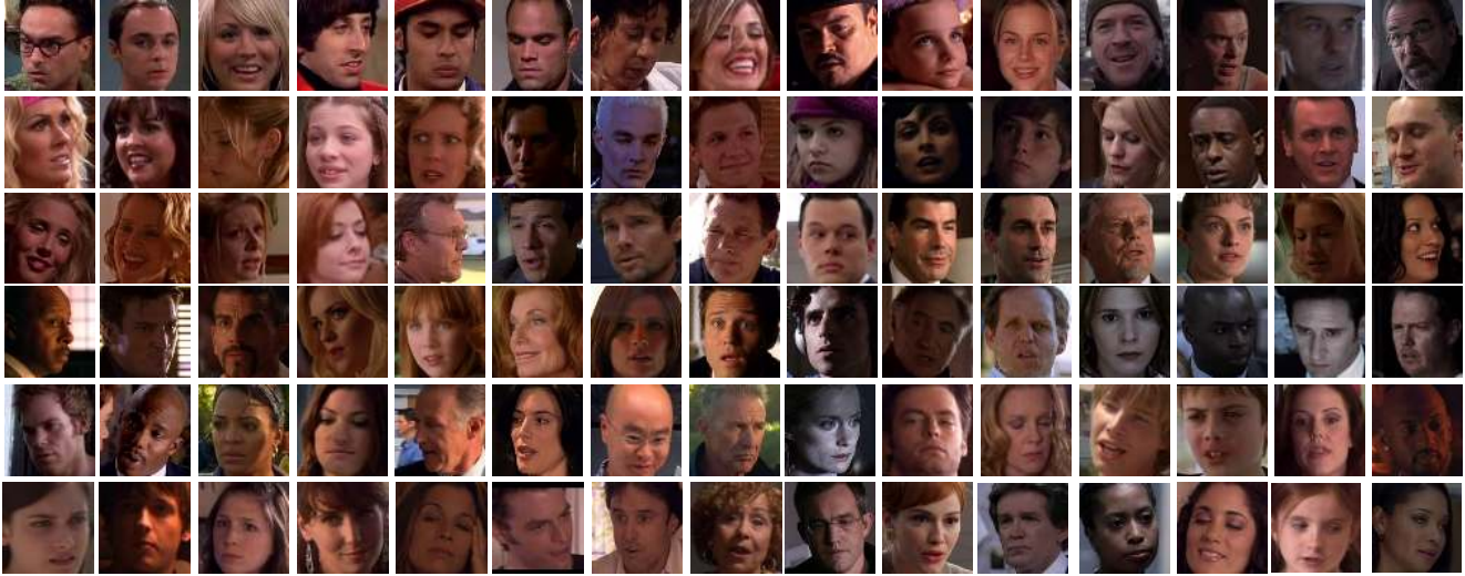
Figure 2. Example faces of the 94 subjects from the proposed TV Series Face Tubes (TSFT) dataset. The dataset has diverse set of subjects (age, gender, race, sex) who appear in different lighting conditions (home, office, bar, field, inside car, at day, at night) and have varied pose, expressions and motions.