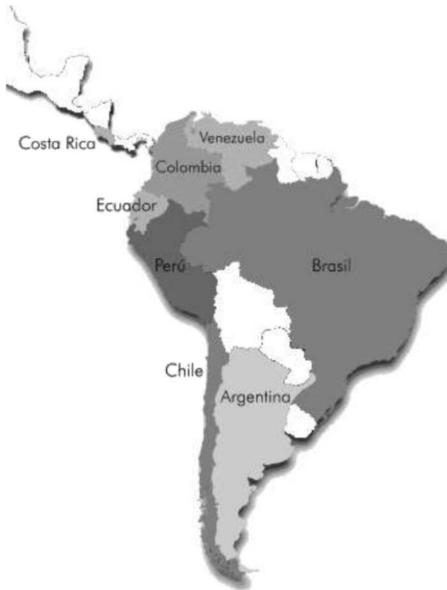
Fig. 1 Latin American countries included in ELANS