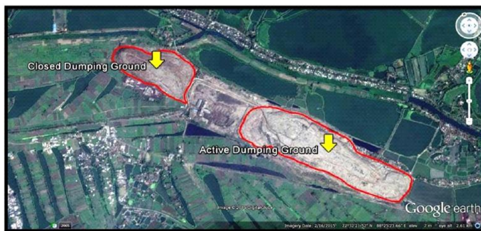
Fig. 1: Location of active and closed dumping ground at Dhapa uncontrolled landfill in Kolkata, India

Kolkata, a metropolitan city of India has a population of 8 million generates about 3000 MT of MSW per day (Chattopadhyay et al. , 2007). Without any prior treatment, bulk of the generated solid waste is disposed on the open/uncontrolled landfill site at Dhapa, Kolkata. No source segregation is practiced, except the rag