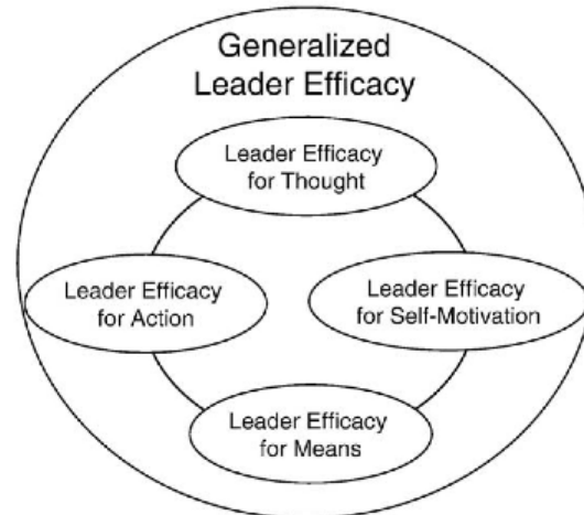
Figure 2. Hierarchical and multivariate structuring of leader efficacy.