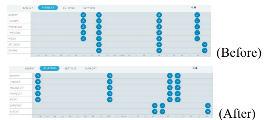
Figure 3. P2 posted screenshots of his schedule before and after he modified it.

With the Nest creating the initial schedule and updating it as the patterns changed, many participants said that they monitored the schedule the Nest was generating. Several participants actively checked to see if it was reasonable. They reviewed the Energy History to look for any abnormalities in how the heating and cooling system had been running. When participants noticed an improper or