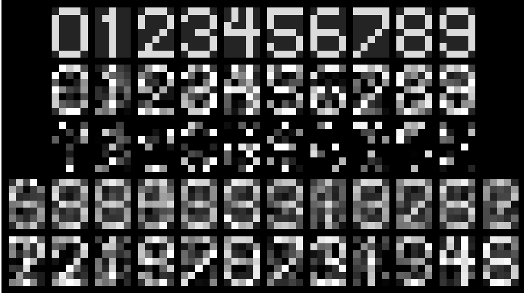
Figure 2: Learning digit patterns. First row: the ten 5 \times 7 templates used to generate the data set. Second row: templates with Gaussian noise added. Third row: templates with noise added and 50% missing pixels. The training set consisted of ten such noisy, incomplete samples of each digit. Fourth row: means of the twelve Gaussians at asymptote ( \sim 30 passes through the data set of 100 patterns) using the mean imputation heuristic. Fifth row: means of the twelve Gaussians at asymptote ( \sim 60 passes, same incomplete data set) using the EM algorithm. Gaussians constrained to diagonal covariance matrices.

In this example (Fig. 2), the Gaussian mixture algorithm was used on a training set of 100 35-dimensional noisy greyscale digits with 50% of the pixels missing. The EM algorithm approximated the cluster means from this highly deficient data set quite well. We compared EM to mean imputation, a common heuristic where the missing values are replaced with their unconditional means. The results showed that EM outperformed mean imputation when measured both by the distance between the Gaussian means and the templates (see Fig. 2), and by the likelihoods (log likelihoods \pm 1 s.e.: EM -4633 \pm 328 ; mean imputation -10062 \pm 1263 ; n = 5 ).