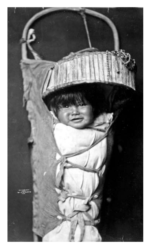
Figure 1: Swaddled Apace infant in traditional cradleboard, 1903 (In the public domain. Library of Congress, Prints and Photographs Division, Edward S. Curtis Collection [reproduction number LC-USZ62–123456]).

Another component of many folk models is the notion that a healthy, happy baby is a quiet baby. Friedl (1997, 100) observed Iranian mothers strapping their frisky, gurgling baby into a cradle to calm it down because 'a happy ... baby is quiet in voice and body'. 'A Kogi mother does not encourage response and activity, but rather tries to soothe her child to keep him silent and unobtrusive' (Reichel– Dolmatoff 1976, 277). This placidity is often achieved through closely confining the infant in a marsupial-like container (MacKenzie 1991, 130, Fig. 1). Tightly swaddled and attached to its mother (Tronick et al. 1994), or