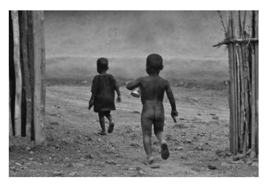
Figure 2: Two male toddlers roaming around a Kpelle village, 1971 (Photo: David Lancy).

doing' (Ochs and Izquierdo 2009, 395). The assertion that children learn their culture largely without instruction has been validated by a series of empirical studies in Samoa. Odden and Rochat (2004) observed children of increasing age to study their growing competence in fishing and measured their knowledge of the social hierarchy and associated ritual and ceremony. They systematically observed children in settings where they might learn these aspects of the culture. In fishing, children might accompany expert fishers and play a supporting role but they never used fishing gear in an expert's presence, nor did an expert offer instruction. The children watched the expert and then, later, borrowed the equipment (nets, spears) to practice on their own, gradually becoming proficient (Odden and Rochat 2004, 44). Similarly, the children acquired 'knowledge ... of the basic concepts underlying the chief system ... through observation and overhearing adult discussions of it' (Odden and Rochat 2004, 46) not through any direct involvement or engagement with adults.