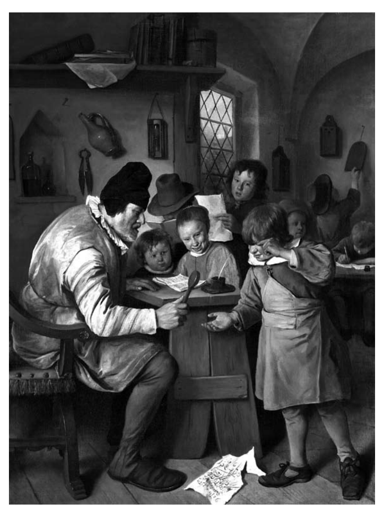
Figure 5: The Schoolmaster (c. 1665), oil on canvas, 110.5 × 80.2 cm, by Jan Steen (1629–79).