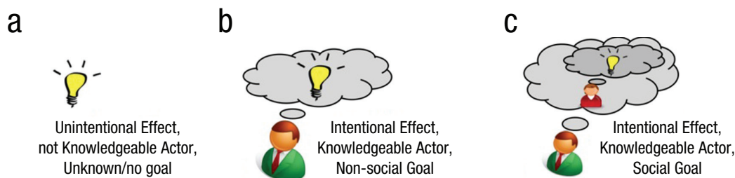
Fig. 1. A schematic of three social learning contexts. When learning from physical evidence (a), learners reason about the implications of the data for different hypotheses. When learning from goal-directed action (b), learners reason about the actor's goal with respect to the world. When learning from communicative action (c), learners reason about which belief the actor intends the learner to have.

People may have a great variety of different goals. Returning to our initial example, a goal may be merely to bring about an effect. I may walk to a far-off neighborhood because I want some good coffee. Alternately, my goal may be to communicate or teach someone something: that this is good coffee (Clark, 1996; Grice, 1975; Sperber & Wilson, 1986). In the