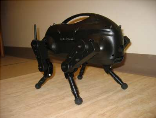
Fig. 1. The LittleDog robot, designed and built by Boston Dynamics.

in spirit, except that we apply dimensionality reduction to the space of controllers, to learn a low-dimensional representation of the control policies themselves.