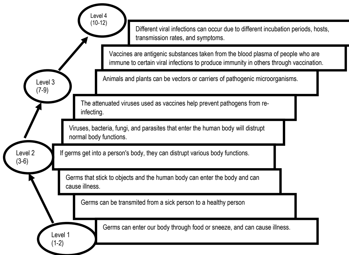
Figure 3. The Sequence of the Concepts about Infection.

Learning progression on disease developed by the NRC (2007) was focused on three categories: 1) Genetics: the diseases caused by genetic disorders in humans. 2) Body defense: how the immune system fights against viruses and prevents them from entering the human body. And 3) infection: show the disease infects humans and how the pathogens or infectors infect the cells. They were further divided into 4 levels: Level 1/K2 (Kindergartens-2nd grades), Level 2 (3rd-5th grades), Level 3 (6th-9th grades), and Level 4 (10th-12th grades). Thirty-two basic concepts for understanding the disease were found from the textbook analysis. Those concepts were distributed and adjusted according to the grades or levels. The analysis also found the discontinuity among the concepts taught in the current system.