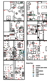
Figure 1. Sensor layout for the seven CASAS smart environment testbeds: Bosch1 (first row left), Bosch2 (first row right), Bosch3 (second row left), Cairo (second row right), Kyoto (third row left), Milan (third row right), and Tulum (bottom row).