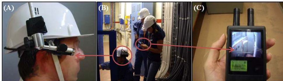
Figure 4. High-definition subcam attached to a hard helmet with its remote monitoring screen

(subjective camera) (Lahlou, 1998), a small digital camera designed to be worn at eye-level by the subject performing the activity.