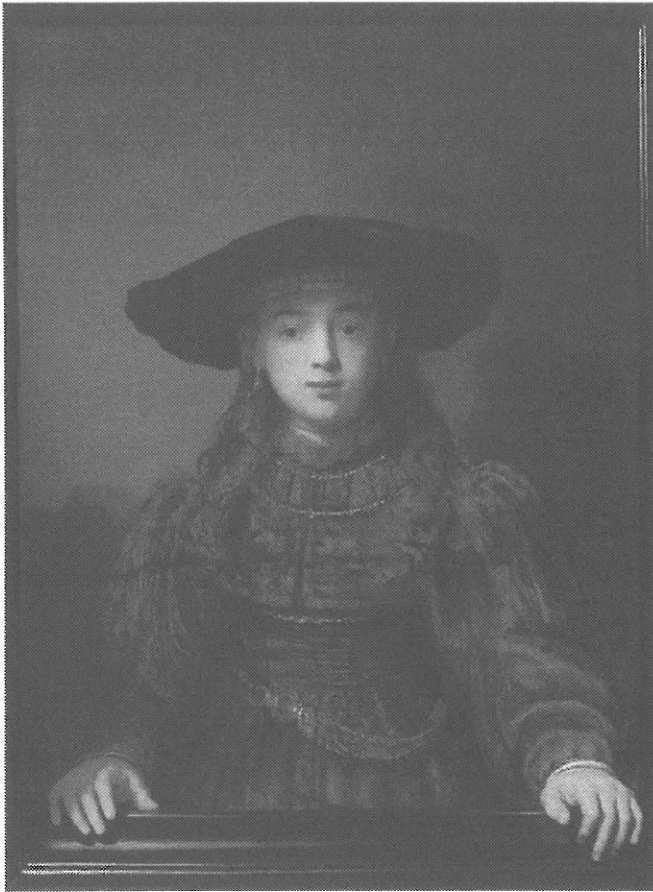
Figure 6: Meisje in een schilderijlijst (1641). Warschau: Koninklijk kasteel. In: Ernst van de Wetering, Rembrandt. Zoektocht van een genie . Zwolle: Waanders 2006, 114

the person of any other, never simply as a means, but always at the same time as an end.” In using the phrase “at the same time” ( jederzeit ), Kant does not say exclusively “as an end”. He is realistic as well. Since you are dependent on the care and attentiveness of others, you always use people as a means in everyday life, but hopefully you do so in a respectful way while being aware that such persons also are ends. Learners can also discuss the difference between means and ends in their concrete daily life experiences.