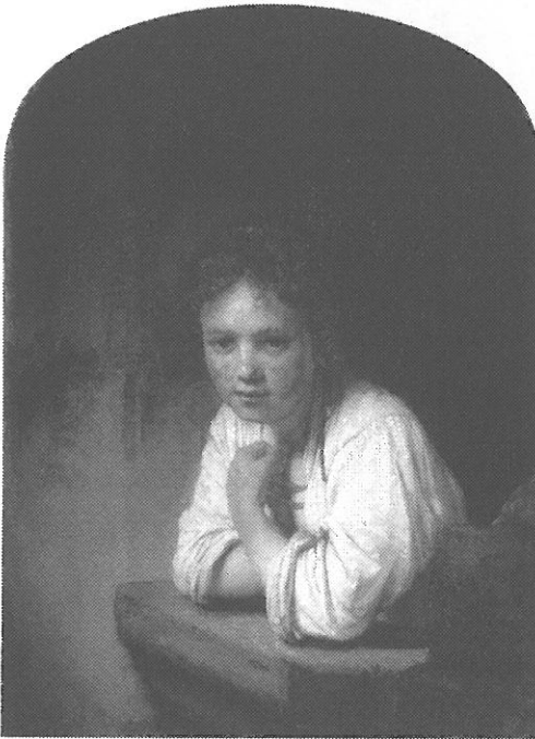
Figure 4: Meisje in het venster (1645). Dulwich Picture Gallery. In: Ernst van de Wetering 2006. Rembrandt. Zoektocht van een genie. Zwolle: Waanders, 193.

The epiphany of the human face evokes and educates one's responsibility towards the dignity of others. You learn a lot about the mystery of a person and about the beauty of human dignity when you see a face looking inward in a spiritual way. What you might see in such faces is difficult to describe. It is a mystery, there is still some transcendence, a meditative attitude and joy for life in them.