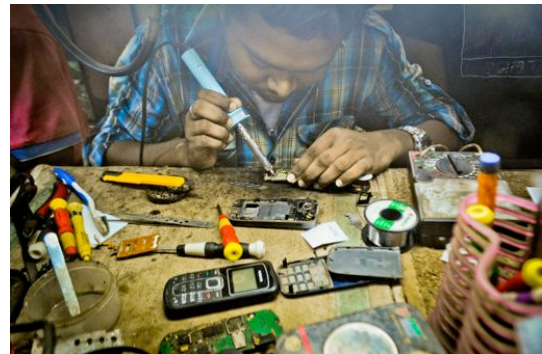
Figure 1: An expert repairer is practicing at his desk in Gulistan Underground Market

very sound attention. I tried to get eyes closer to the IC so that I could see it better, but it was not possible because of the hot air gun blowing hot air. My hand was trembling, and I was struggling to grip the chip with my forceps. But after a number of failed attempts, finally I succeeded ...”