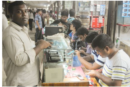
Figure 3: Repairers at Gulistan Underground Market.

like this to an old friend. You have to value people in order to value your business.”