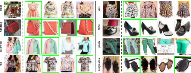
Figure 3. Sample retrieval results from the unified model. The images to left of the dashed lines are query images. The items in green bounding boxes are the correct retrieval results.

This paper presents our discoveries on how to learn a unified embedding model across all apparel verticals. A novel way is proposed to ease the difficulty in triplet-based embedding training. Embeddings from separate specialized models are used as learning target for the unified model. The training becomes easier and makes full use of the feature space. Successful retrieval results are shown on the learned unified model.