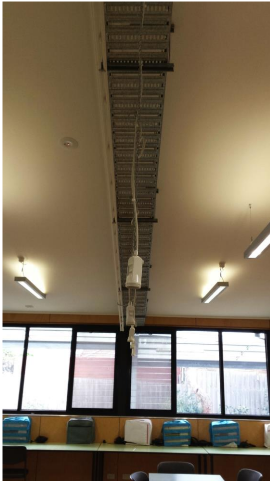
Figure Five. Newly installed power sockets in refurbished classrooms. These are located in ceilings and under whiteboards, meaning that they can only be used in full sight of a teacher. (Lakeside)