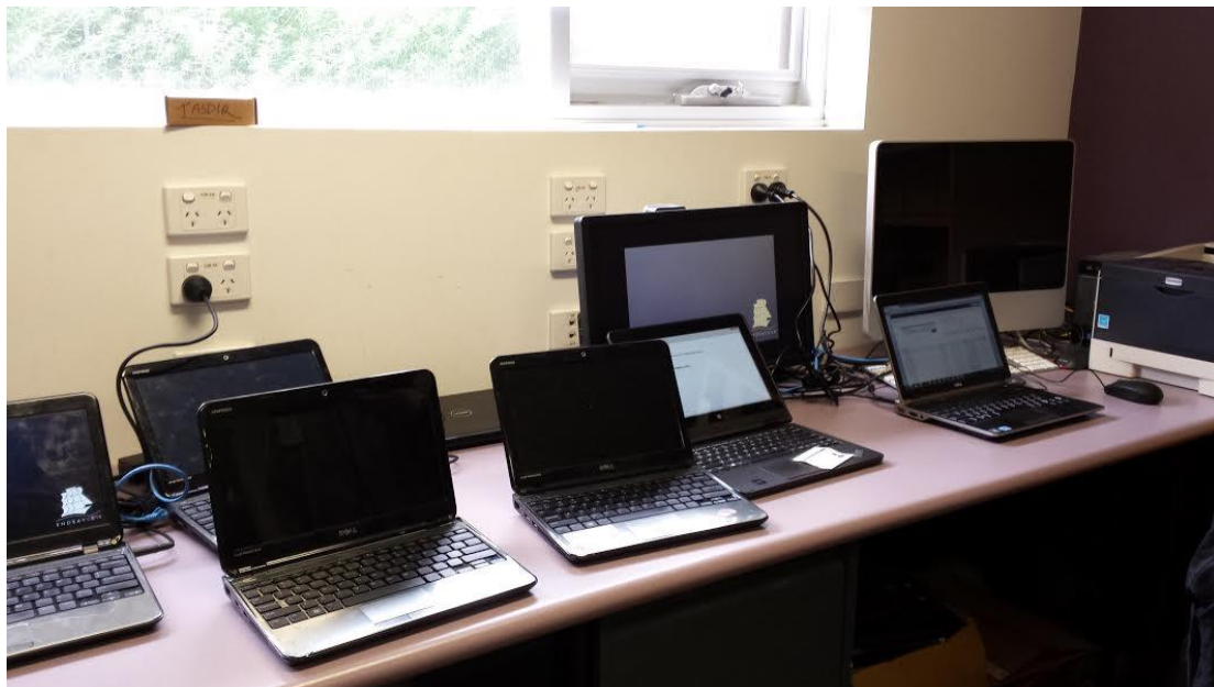
Figure Eight. Backlog of student devices waiting to be fixed by JB Hi-Fi technicians (Lakeside)

A lot of students come in to ask for my help and I’m not obliged to help them. I still do because that’s the right thing to do, you can’t really deny a student for helping small issues to get them back on track ... but I had a flood of students come in to me with their phones and say “Hey look my phone’s not working”. And I say, “Well look sorry guys, I don’t fix Telstra [Australian telephone network] stuff, you know, I fix the devices of the school ... With [school-owned equipment] it’s simple I can pull apart a computer completely, do whatever I want to it, and it’s fine. But a student’s one, we wouldn’t ever dare open it up because if something was misplaced or not put back in the right way then we can be held accountable for any damage. [38]