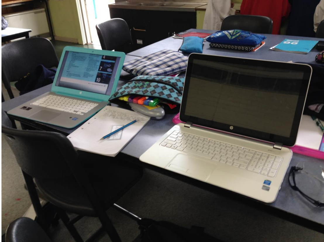
Figure one: Desks with devices, cases, chargers and connectors (Mountview)

laptops either open or closed. lots of cables and chargers. There are a few books, pens and pencils. But mostly *heaps* of technology” [8].