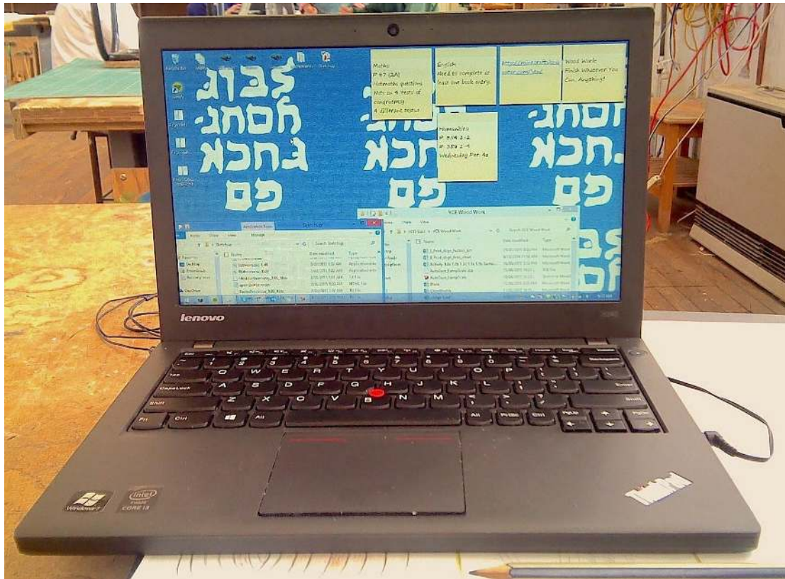
Figure seven. Year Eleven student device displaying self-designed wallpaper, school reminder notes and various open windows (Lakeside)

Device-related tensions were also apparent between students the schools’ technical staff. These issues were not manifest during class times but were of concern for the schools’ technical staff who tended to be tucked away in window-less rooms in far-flung sectors of the school campuses. These staff were responsible for a range of technology-related work within the schools, including maintenance of hardware and software infrastructures, ensuring that school networks were running, monitoring use of school systems and generally ensuring that IT functioned. The influx of student devices had undoubtedly complicated the work of technical staff in the three schools. In particular IT technicians (only a few individuals in each school) had become inundated with students wanting personal devices maintained and fixed.