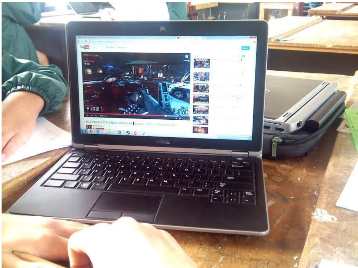
Figure three. Year 9 – Killing Floor2 video on YouTube (Lakeside)

responding to text messages and very occasionally taking calls. These communications almost always were initiated by parents and carers. Policing this practice was acknowledged as an on-going and largely unresolved problem for school authorities. As a Middleborough Assistant Principal described, “the parents think they can call their kids at any time, even during class. They don’t bother going through us. They call the student directly. Sometimes students call their parents and tell them they’re sick and want to go home. We’ve had the occasional student go home without telling anybody” [23]. All three schools were reluctant to impose outright bans, but felt obliged to ‘discourage’ parents and students from contact [24]. School newsletters and websites would carry reminders and warnings after notably disruptive incidents (see Figure Four). All told, an underlying concern for school leaders and administrators was that student devices were allowing families to ‘bypass’ official systems - “they’ve got to go through the correct channels” [24].