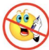
Figure Four: School efforts to curtail parental use of phones and other devices to engage with students (Mountview newsletter August 2015, Middleborough newsletter April 2016)

It is important for students to remember that mobile phones are not to be brought to class. Mobile phones need to be kept in lockers and only used before school, snack time, lunchtime and after school.