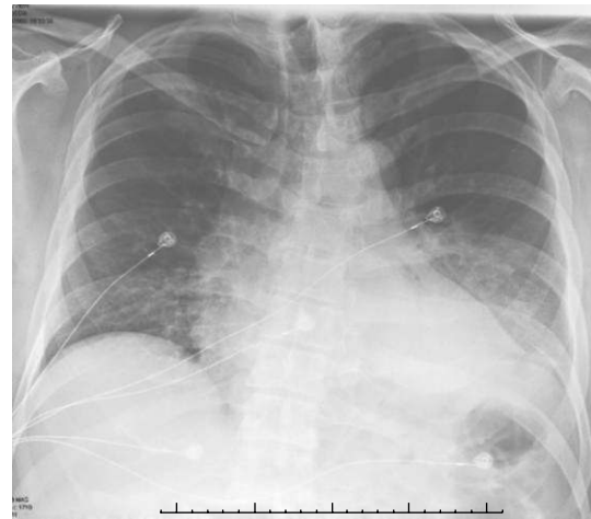
FIGURE 1: Chest X-ray on day 1 showing bilateral basal infiltration.

occurred concurrently and the improvement in ataxia, dysarthria, and facial weakness occurred with the treatment of pneumonia, we presumed that the neurological symptoms were due to Legionella pneumoniae .