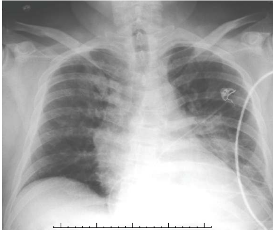
FIGURE 2: Chest X-ray on day 4 showing resolution of the earlier changes.

In literature, we came across only two cases with facial nerve palsy in the setting of legionellosis, and they were different from our case for multiple reasons.