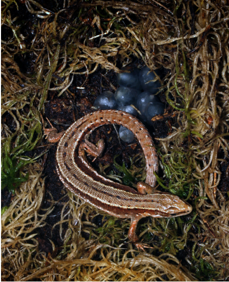
Figure 1. Female common lizard ( Zootoca vivipara ) from viviparous population in Slovakia with freshly laid eggs. The fully developed juveniles hatch within few hours to 1 day.

et al. 2001, 2006) and it has the widest geographic range of all terrestrial reptiles, occurring from Ireland in the west to Japan in the east and from southern Spain to northern Scandinavia (see Fig. 2 and Table A1; Dely and Böhme 1984). We specifically focused on testing whether (1) differences in seasonal activity better explain variation in body size than differences in mean ambient temperature experienced during activity; (2) costs associated with higher growth rates (longer seasonal activity) are offset by some benefits (e.g. improved fecundity or survival; Arendt 2011); (3) other abiotic factors which have an effect on growth rate (e.g. via food availability) significantly contribute to variation in body size; (4) the potential costs of higher growth rate are offset by benefits in terms of fecundity or survival at the population level.