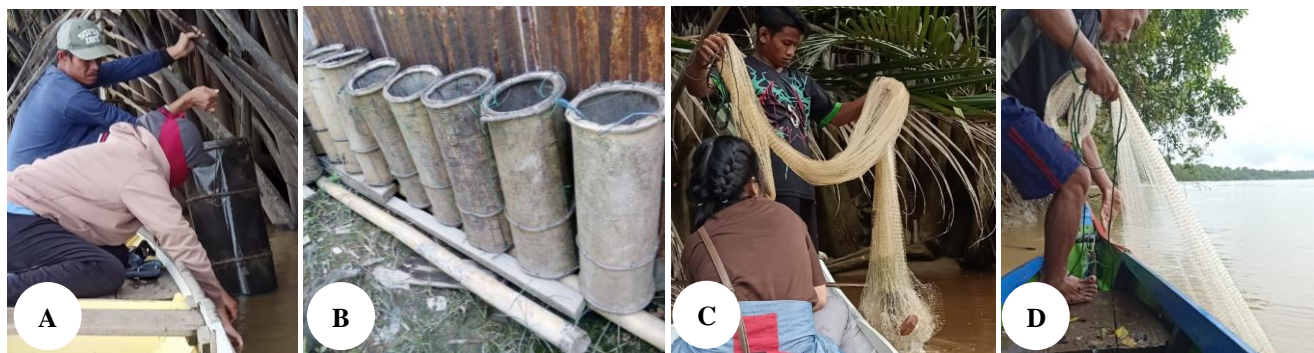
Figure 2. Fishing techniques used by fishermen in different sampling sites. A. Prawn traps, bubu (Salimbatu Village); B. Prawn trap, bubu (Buong Baru Village); C. Casting net (Tepian Village); D. Casting net (Sesayap Village)