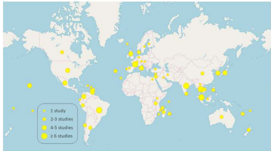
Fig 1. Geographic distribution of all 145 publications included in the literature review. Map template obtained from OpenStreetMap.

https://doi.org/10.1371/journal.pntd.0007499.g001