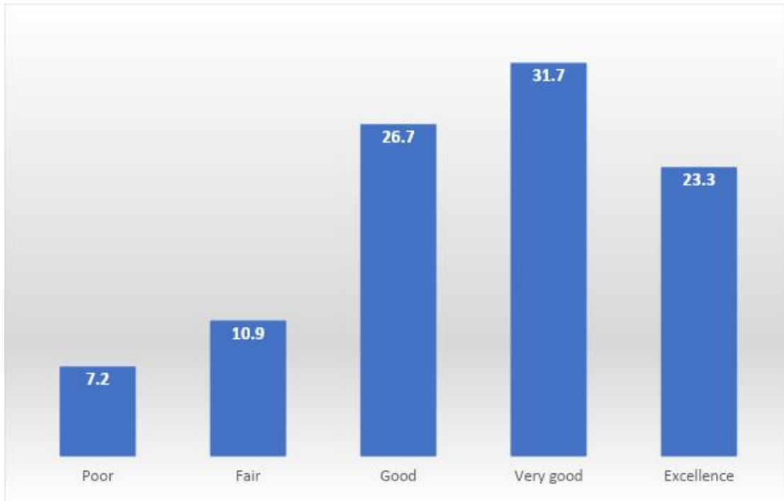
Fig. 2. Information available on COVID-19 by PHCW