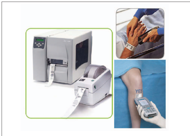
Figure 5. InfoLogix H-2842-Z and S4M printers [left] print barcodes and human readable text on RFID embedded wristbands for mobile objects. A mobile reader scans mobile objects tagged with the InfoLogix Zebra wristband [top right] and a self-adhesive surgical label [bottom right].

captured using RFID. Moreover, the record of the entire care process is useful if the patient ever returns for additional care. The medical history could be readily retrieved to view past diagnosis and treatment. Or the patient could even be given the record upon discharge in an RFID-tagged hospital card or subcutaneous implant.