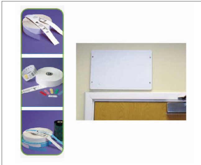
■ Figure 3. RFID embedded patient wristbands in roll form, from InfoLogix7, prior to being printed are used to tag mobile objects; A flat panel fixed reader, from European Antennas8, installed above doorway to track patient and asset movements.