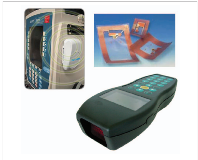
■ Figure 4. A fixed object tagged with an InfoLogix HealthTrax RFID asset tag [top left, white box] and RFID tags prior to installation9 [top right] can be read by the mobile HeliScan M handheld reader from Orion International10 [bottom].

result for vials scanned at the end of rounds would be vials recorded in the central repository and scanned at the lab for processing. Examples outside of this condition include, vials taken and recorded during patient rounds and placed, and forgotten, in lab coat pockets are flagged as missing; vials found in the cart that are unrecorded are flagged as new and added to the batch; vials listed as processed and found in the cart are flagged as possibly involving fraud or a system error because an already processed vial with a unique ID cannot be collected and processed twice. Because every vial is uniquely identified, for each possibility the phlebotomist has the opportunity to correct any error.