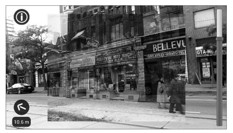
FIGURE 3.2 1955 overlaid on top of 2013. It was difficult to line things up exactly because I was standing in the middle of a busy street.