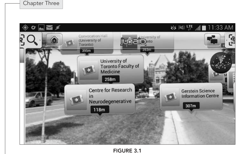
Junaio View. North Along University Avenue at College Street in Downtown Toronto

But actually that's not true: these aren't really augmented reality, the way AR will be. As first steps in AR, these apps and the others I'll cover are powerful. Compared to the AR we'll have by 2017, they're boring. It's difficult to talk about AR right now because things are changing very quickly. This is especially true with AR glasses. Some of the technology in this chapter will be out of date when you read it, but the general directions will, I hope, be relevant for a while.<sup>2</sup>