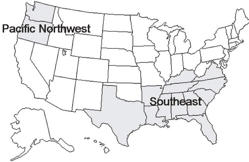
FIG. 1. Survey regions for the production of glued-laminated timbers, lumber, laminated veneer lumber, plywood, and oriented strandboard produced in the Pacific Northwest and Southeast regions of the United States.

multi-unit process approach was modeled for lumber, plywood, and OSB. For specific process descriptions see individual CORRIM reports for each.