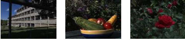
Fig. 3: Light Fields used in the tests: “Building”, “Fruits” and “Rose”. All of the three are captured by Lytro Illum camera and demultiplexed by Lytro Power Tools Beta software.