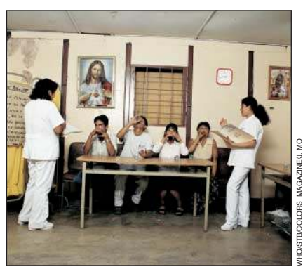
Tuberculosis advocacy in Lima, Peru

AIDS epidemic are generated by countries themselves using standardised methods.2 In addition to empowering countries and stimulating the use of data for health action, this approach shows the importance of solid surveillance systems to countries. Capacity building in countries is therefore producing not only better country data but also better global monitoring. It would be wise to build on the current momentum of partnership and collaboration led by the Health Metrics Network and