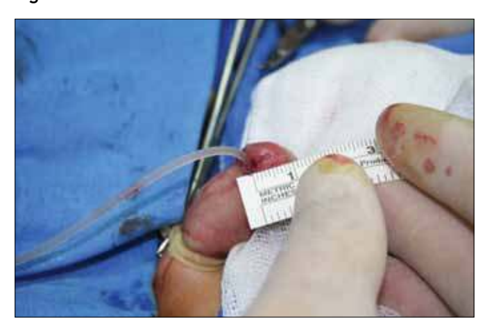
Figure 2. The distance between the urethral meatus and tip of the glans measured and recorded

Glans wings were wrapped around the urethra as in the normal configuration, and sutured with 2 layers of interrupted sub-epithelial 6/0 polydioxanone sutures. The deeper layer secured the urethra to the glanular tissue and the superficial layer approximated the glans wings. The anterior lip of the urethra was secured to the glans with four interrupted sutures, two on each side of the midline. The penile tourniquet, which was used intermittently during dissection, was removed when the glans reconstruction was completed. Circumcision was performed in all primary cases and the operation was terminated (Figure 5). A compression dressing was applied.