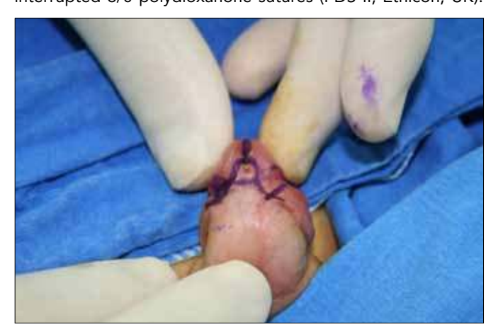
Figure 1. Incision lines outlined and marked