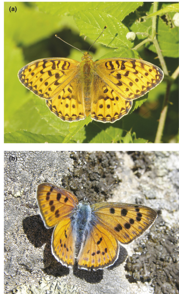
Figure 1. The dark-green fritillary Argynnis aglaja and purple shot copper Lycaena alciphron . The lower elevational limits of these butterflies in central Spain have shifted uphill by 150 m and 400 m, respectively, associated with a 1.3 °C increase in mean annual temperature since 1967–1973 [73]. The loss of such species from lower elevations suggests a failure to adapt to ecological changes at the species' margins.

Gene flow might be particularly important for adaptation to climate change, given that many of the alleles required at a species' poleward edge might already exist at the equatorial edge. Sustained evolutionary responses to climate change could depend on such alleles being able to move poleward rapidly. Once again, this focuses attention on how easily alleles can move along selective gradients, and through different genetic backgrounds, to where their fitness is highest. Such movement might be particularly difficult to achieve if population densities are reduced, or selective gradients are locally steepened, by anthropogenic habitat loss [18].