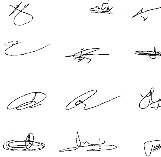
Figure 2. Cursive signature examples