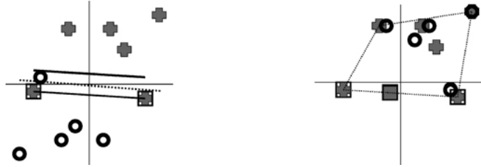
Figure 2. Noisy hard margin LP solution for two confidence-rated hypotheses. Left is the separation in label space. Right is separation in dual or margin space.

point C = \sum_{i=1}^{\ell} u_i y_i H_i in the convex hull closest to the origin as measured by the infinity norm. This optimal point is indicated by a shaded square. It is a convex combination of two support vectors which happen to be from the same class. Recall that this dual vector will be used as the misclassification costs for the base learner in the next iteration. In general, there exists an optimal solution for a hard margin LP with k hypotheses with at most k positive support vectors (and frequently much less than k ). Note that in practice the hard margin LP may be highly degenerate especially if the number of points is greater than the number of ensembles, so there will be many alternative optimal solutions that are not necessarily as sparse. But a simplex based solver will find the sparse extreme point solutions.