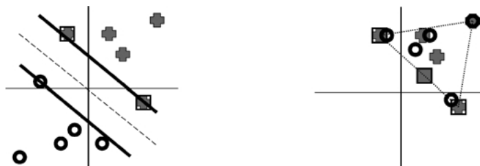
Figure 1. No noise hard margin LP solution for two confidence-rated hypotheses. Left is the separation in label space. Right is the separation in dual or margin space.

Let us examine geometrically what the hard and soft margin formulations do using concepts used to describe the geometry of SVM in Bennett and Bredensteiner (2000). Consider the LP subproblem in the column generation algorithm after sufficient weak hypotheses have been generated such that two classes are linearly separable. Specifically, there exist \rho > 0 and a such that y_i H_i a \geq \rho > 0 for i = 1, \dots, \ell . Figure 1 gives an example of two confidence rated hypotheses (labels between 0 and 1). The left figure shows the separating hyperplane in the label space where each data point x_i is plotted as (h_1(x_i), h_2(x_i)) . The separating hyperplane is shown as a dotted line through the origin as there is no threshold. The minimum margin \rho is positive and produces a very reasonable separating plane. The solution depends only on the two support vectors indicated by boxes. The right side shows the problem in dual or margin space where each point is plotted as (y_i h_1(x_i), y_i h_2(x_i)) . Recall, a weak hypothesis is correct on a point if y_i h(x_i) is positive. The convex hull of the points in the dual space is shown with dotted lines. The dual LP computes a point in the convex hull 2 that is optimal by some criteria. When the data are linearly separable, the dual problem finds the