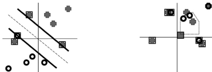
Figure 3. Noisy soft margin LP solution for two confidence-rated hypotheses. Left is the separation in label space. Right is the separation in dual or margin space.

margin LP (see Eq. (2)) both in the original label space on the left and the dual margin space on the right. On the left side, we see that the separating plane in the hypothesis space is very close to that of the hard margin solution for the no-noise case shown in figure 1. This seems to be a desirable solution. In general, the soft margin formulation is much less sensitive to noise.