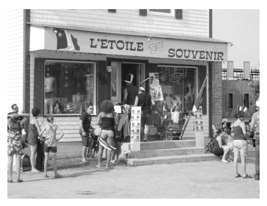
Figure 2: An Acadian souvenir shop in Caraquet, New Brunswick