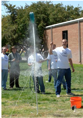
Figure 1: Rocket launch