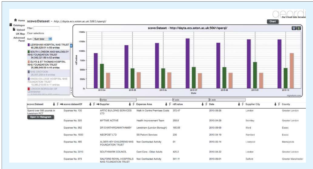
Figure 3. Multiple source link-sliding and custom charting for combined data with Geordi. The user has developed this view of the data and is able to examine specific expenses from aggregated spending data.

SameAs bundles equivalent URIs together and separates knowledge about equivalence from the main datasets, thereby enabling different applications to use different coreference services (and thereby different bundles) in different contexts.