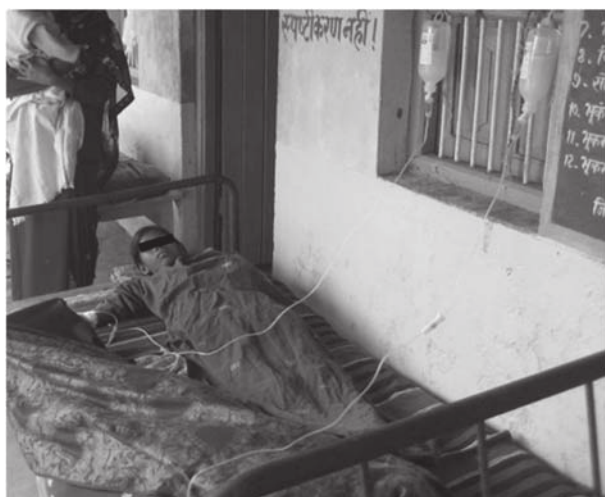
Figure 1. Young female patient with visceral leishmaniasis receiving liposomal amphotericin B infusion at Vaishali District Hospital, Bihar State, India.